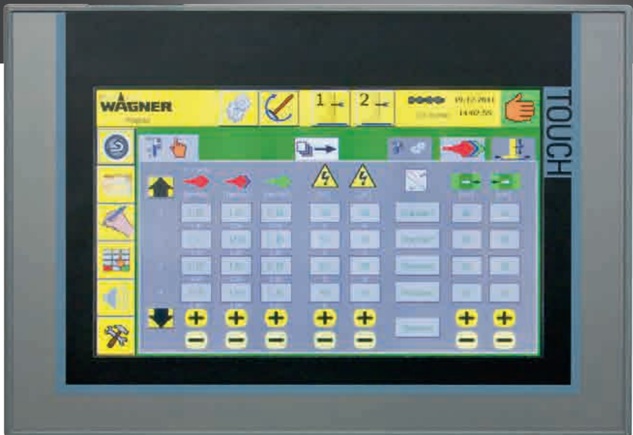
Touch panel 12"