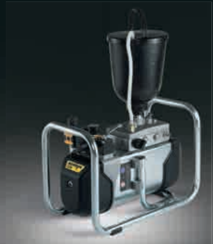
Double diaphragm pump