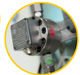
Gear flow meter