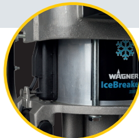
WAGNER stroke sensor

The unit can be configured to specific customer requirements. It is delivered fully assembled and ready to be connected.