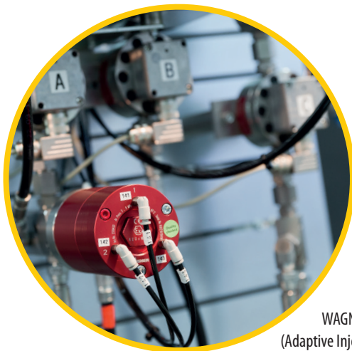
WAGNER AIS (Adaptive Injection System)