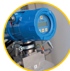
Coriolis flow meter